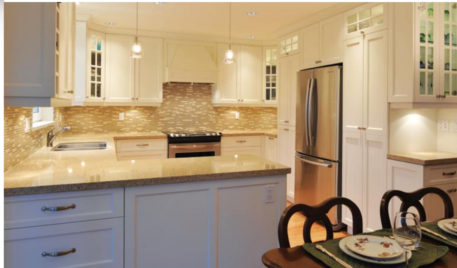
PICTURED TOP Kitchen Design by Corey Klassen, AKBD.