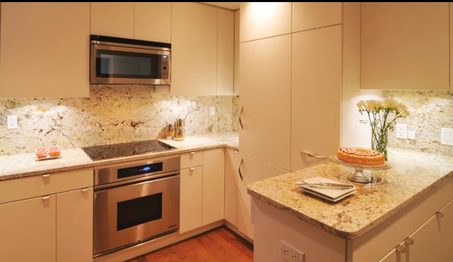
PICTURED TOP Kitchen Design by Robyn York, CCI Renovations.

“Using hardware to access blind corners is a great solution, as well as using drawers for storage in as many locations as possible,” says Friswell.